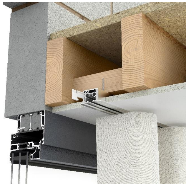
Recess Profile + Track Profile + Insert